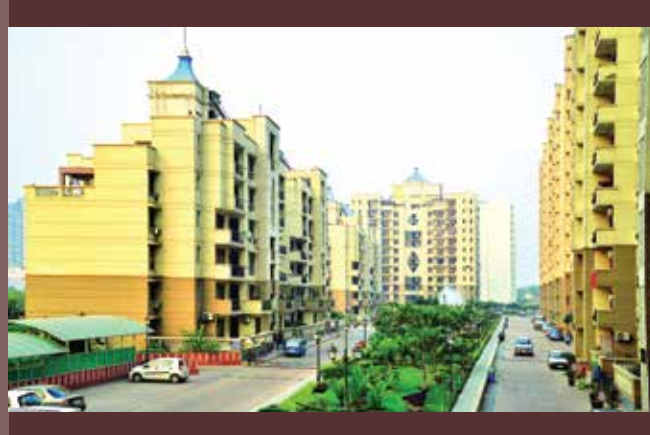
PURVANCHAL HEIGHTS Sector-Zeta 01, Greater Noida