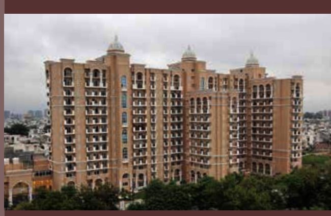
PURVANCHAL KINGS COURT Gomti Nagar, Lucknow

Purvanchal Projects takes pride in the incredible developments it built with so much dedication and passion. Take a look at some of our breathtaking projects that laid the foundation for a better lifestyle in Noida, Greater Noida, and Lucknow.