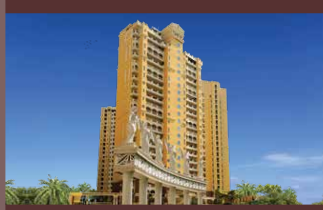
PURVANCHAL ROYAL CITY PHASE I Sector CHI-V, Greater Noida