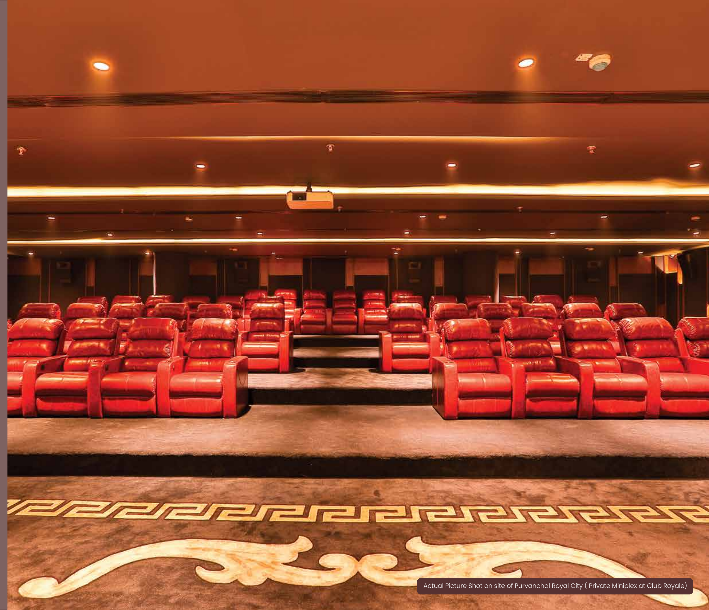
Actual Picture Shot on site of Purvanchal Royal City ( Private Miniplex at Club Royale)

Club Royale Built On An Area Of 1 Lakh Sq. Ft. Approx | Squash, Badminton, & Basketball Play Area | Two Half Olympic Size Swimming Pools 4000 Sq. Ft. Gymnasium | Creche & Kids Play Zone | Dance & Music Classes | Shopping Centre | Lavish Party Halls | Concierge Services Open Air Jacuzzi | Private Miniplex | Library | Indoor Games | Jogging Track | Nursery School | Golf Carts | Spa