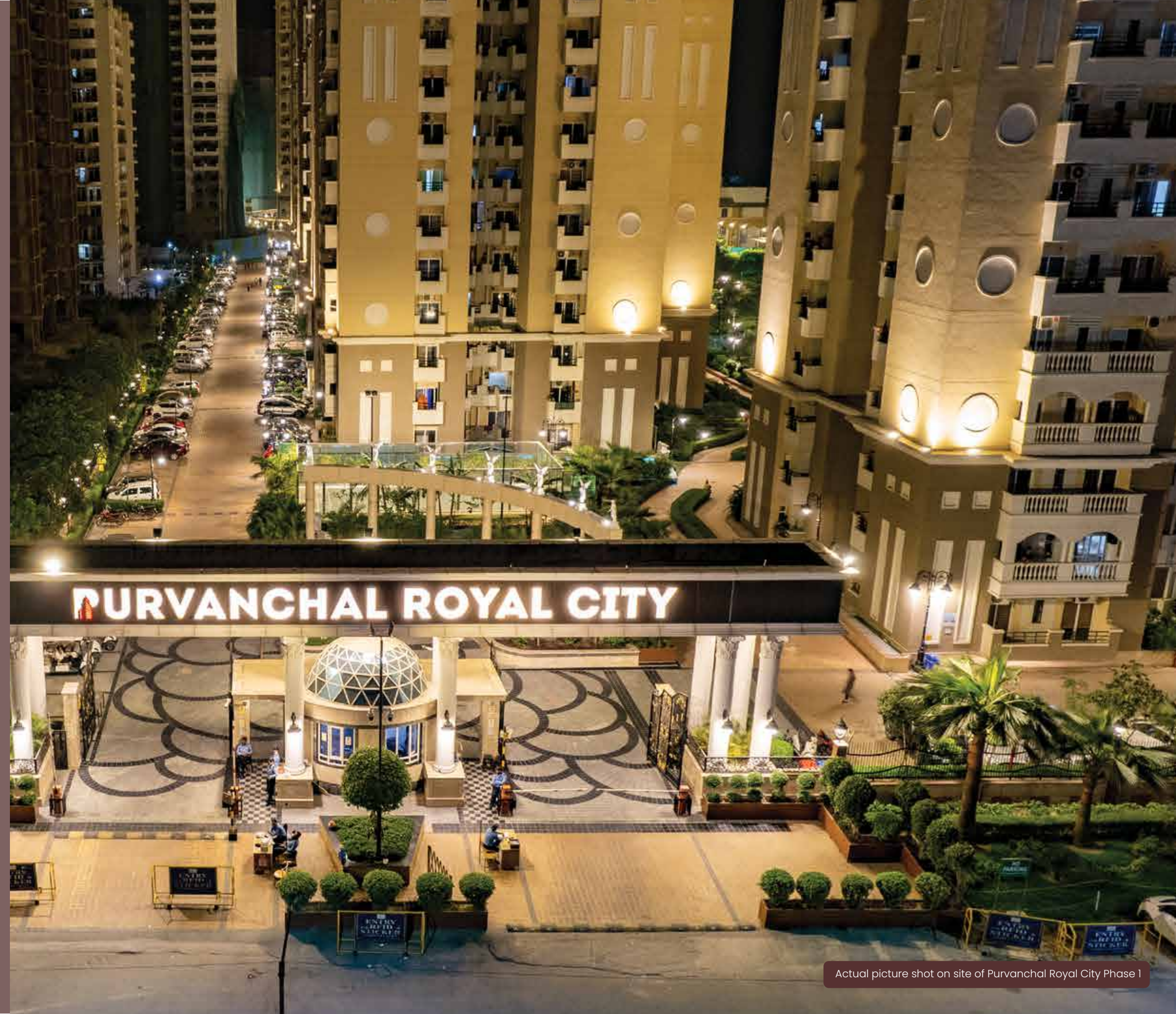
Actual picture shot on site of Purvanchal Royal City Phase 1

Upcoming Jewar International Airport 20 Min. Drive