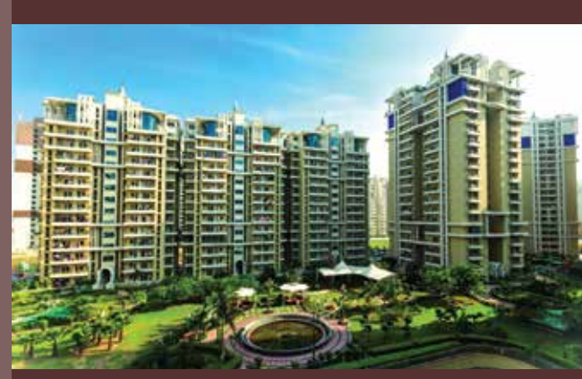
PURVANCHAL ROYAL PARK Sector-137, Noida