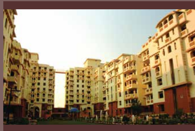
PURVANCHAL SILVER ESTATE Sector-50, Noida