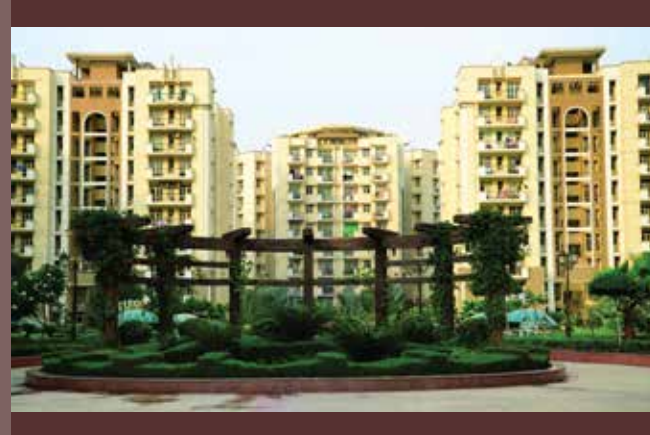
PURVANCHAL SILVER CITY II Sector Pi II, Greater Noida