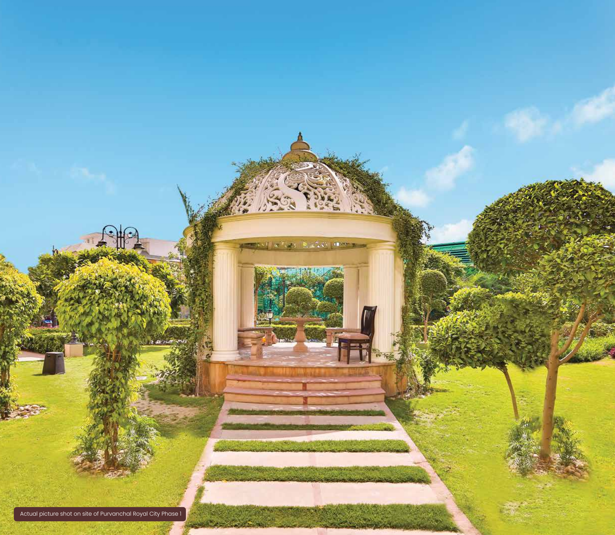
Actual picture shot on site of Purvanchal Royal City Phase I