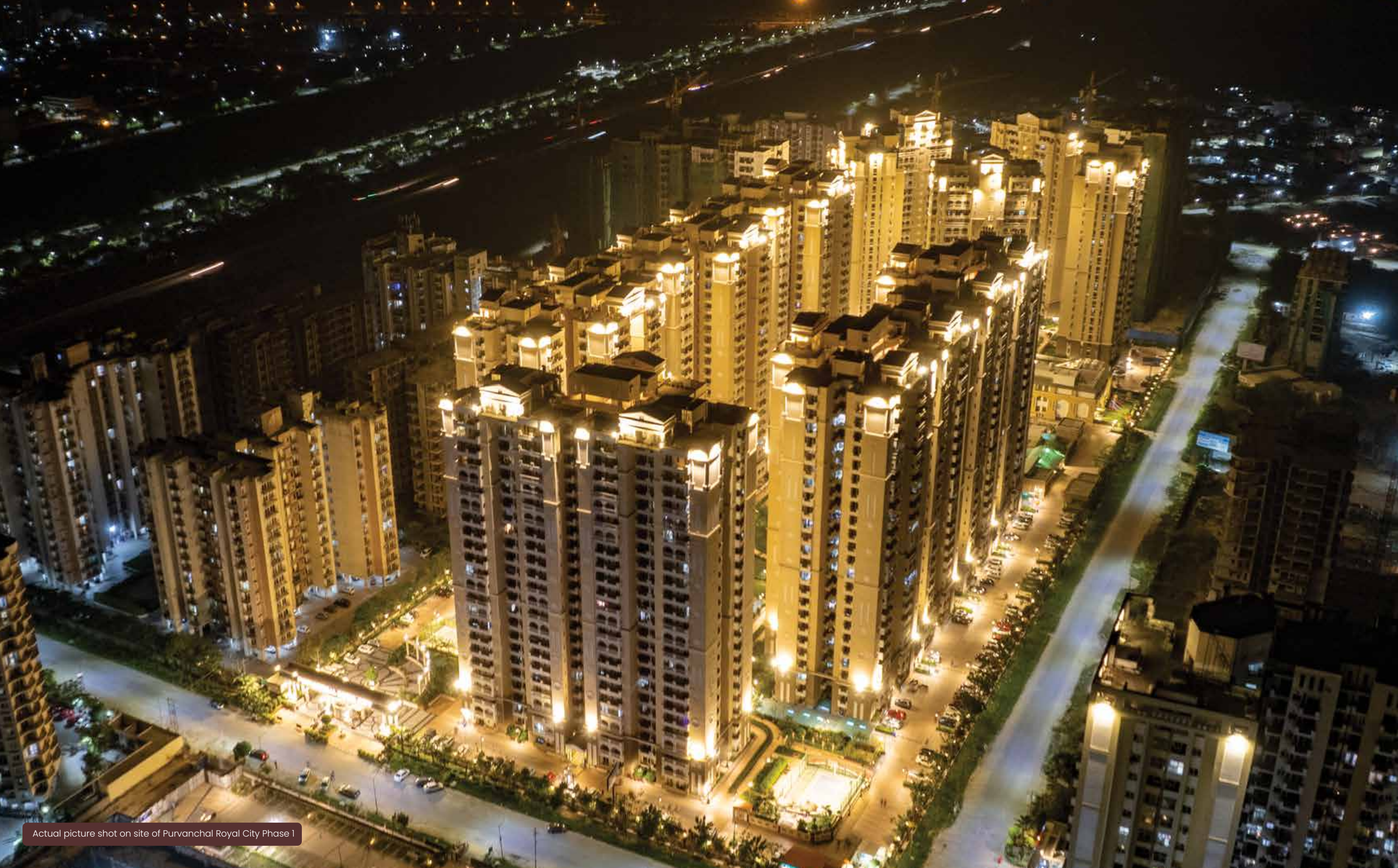
Actual picture shot on site of Purvanchal Royal City Phase I