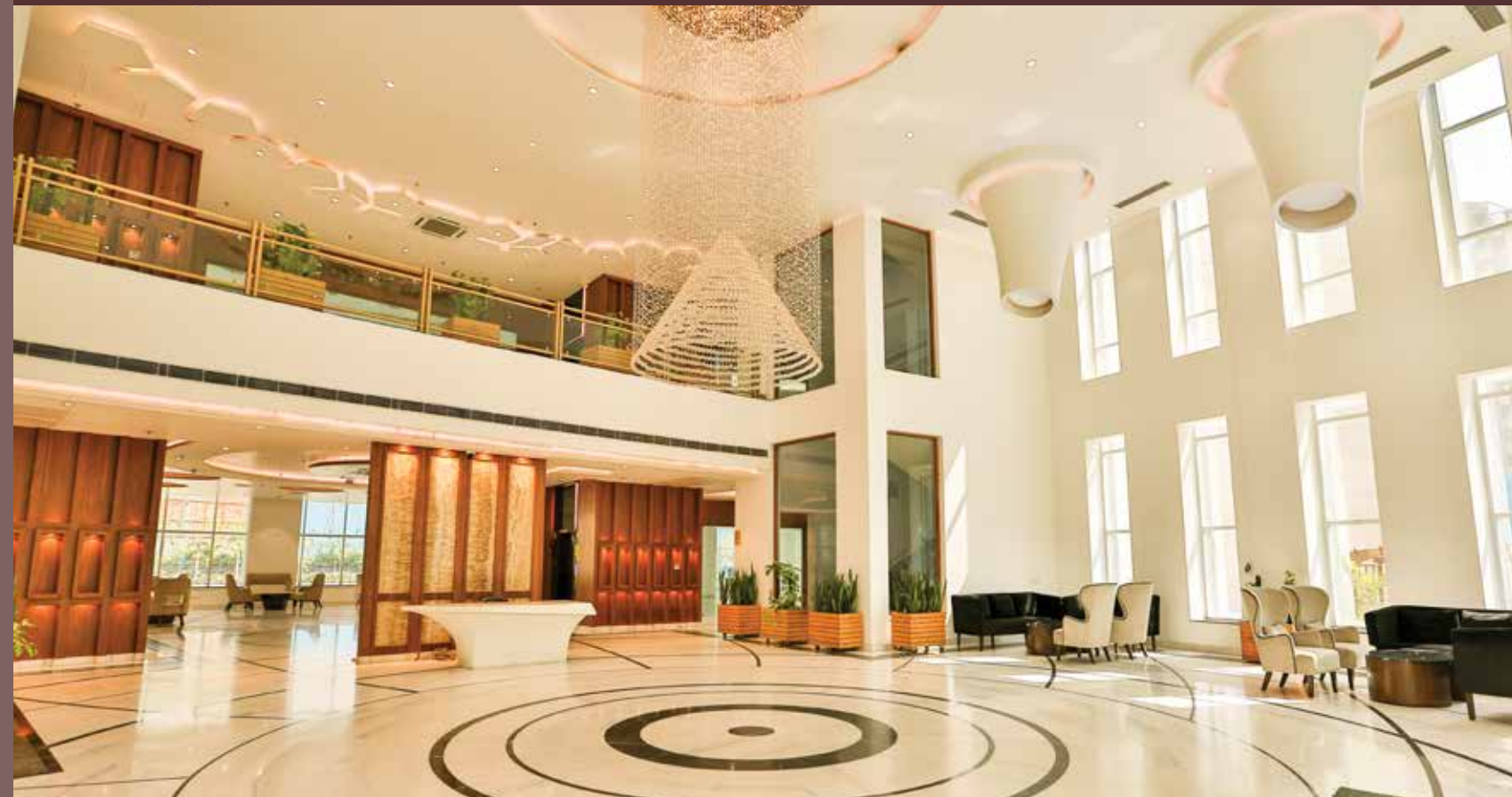
Actual Picture Shot on site of Purvanchal Royal City (Club Royale)

The project is replete with exquisite amenities to make everyday living luxurious and blissful. With a host of facilities, Club Royale is an epitome of extravagance; designed to not just meet but exceed your expectations.